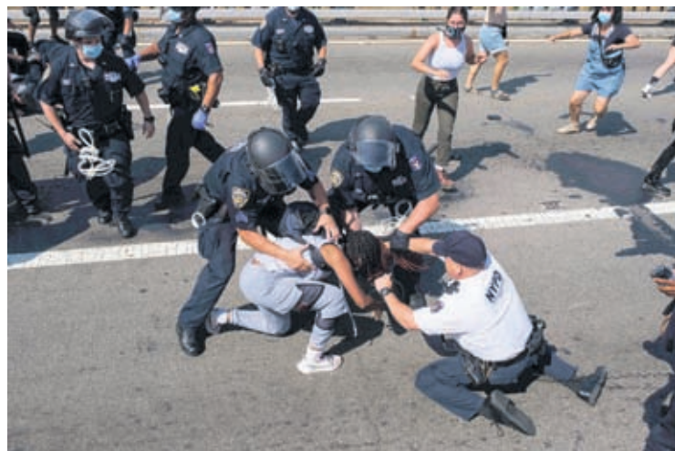
Black Lives Matter protesters are arrested by NYPD officers on the Brooklyn Bridge, Wednesday, July 15, 2020, in New York.